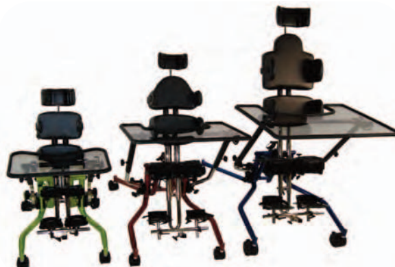
Systems pictured above include optional clear tray top.

These units include: High-loading platform ht; Folding base and components to support Prone, Vertical, Supine or Multi-Position configurations. Packages include: Hip pad with laterals, Chest pad with laterals, Support vest; Soft hip pad; Headrest; Chinrest; Multi-Position foot system; Opaque tray; Hands free standing angle adjustments; Height and depth adjustable knee pads; Lock out block and Upgraded steel locking casters. This packaged system can be accessorized and quoted to fit your client's needs with the items listed on this page.