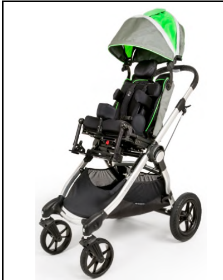
For Advanced Seating See pages 3 and 4