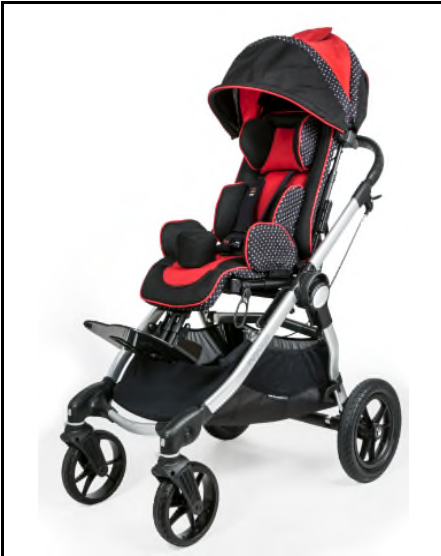
For Moderate Seating See page 2