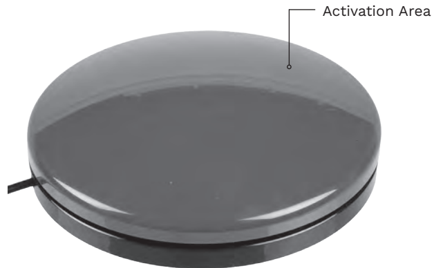
Big Buddy Button

Devices shown below are examples of wired accessibility switches. More information for your wired accessibility Switch can be found at www.ablenetinc.com .