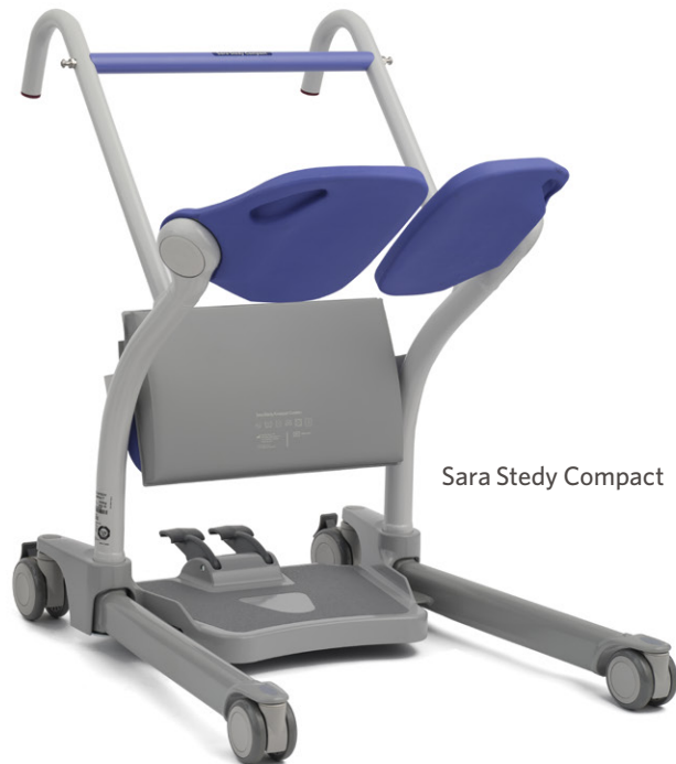
Sara Stedy Compact

The Sara® Stedy kneepad cushion provides additional comfort for patients and residents who may be sensitive in the knee area. The cushion is able to be used on both the Sara Stedy and the Sara Stedy Compact.