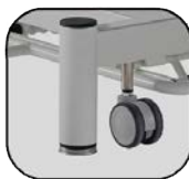
3" (7.6 cm) silent casters, adjustable feet