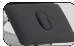
nose hole cut out