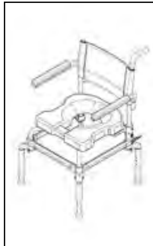
Z4441 with optional ZRB1815 and ZCHL