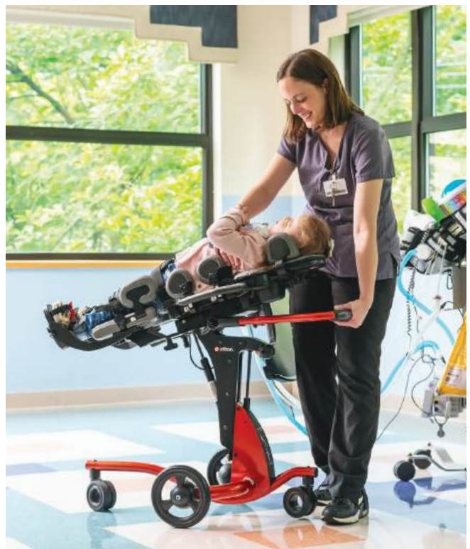
The Stander in supine configuration.