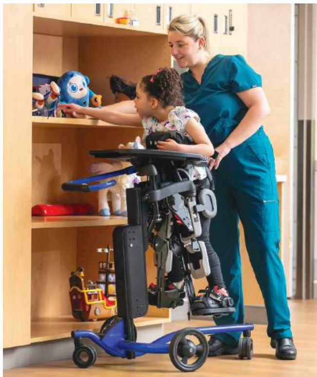
The Stander in prone configuration.