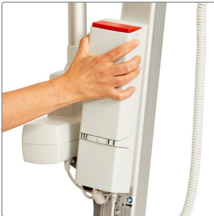
New battery with increased capacity

Caring for others requires equipment you can depend on, and for decades, Molift mobile lifts have been recognized globally for their unwavering performance. To ensure we continue to meet your evolving needs, we've listened, innovated, and are proud to introduce our upgraded Molift floor lift series. Experience a new level of functionality and comfort, as these lifts are now equipped with advanced features designed to optimize your experience and provide lasting value.