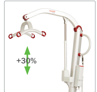
Turbo boost when unloaded