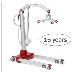
Significant increase of product lifetime